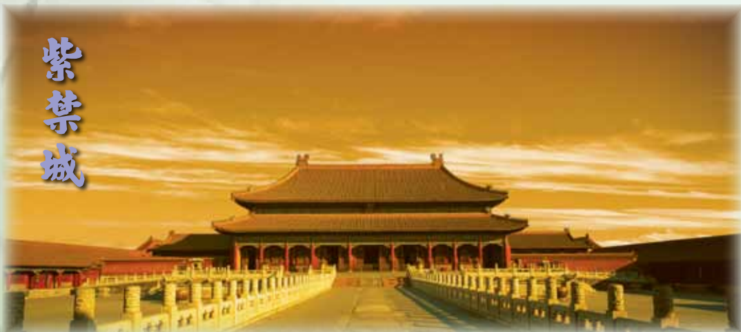
Beijing - The Forbidden City